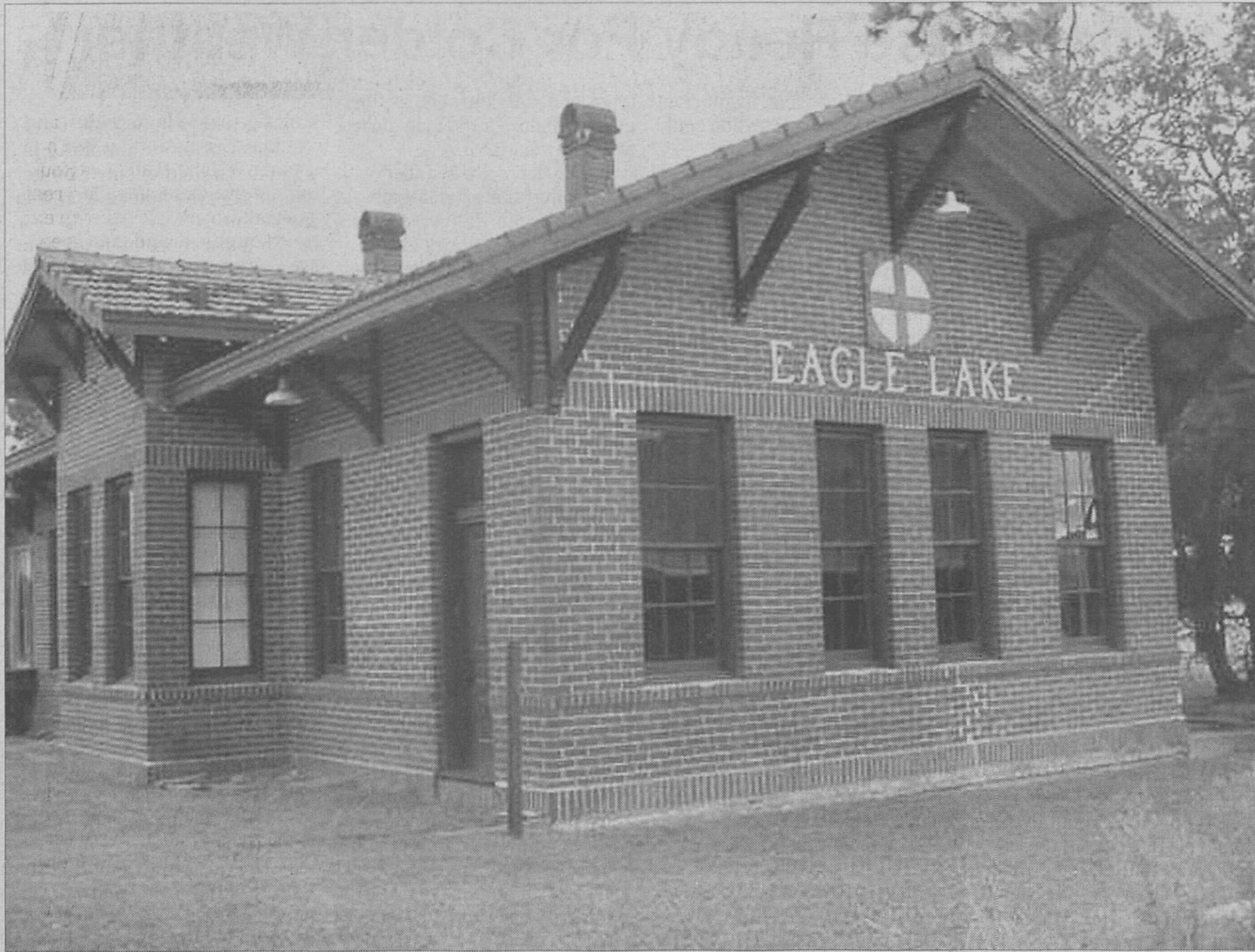
The Eagle Lake Civic Garden Club will again this year feature the historic Santa Fe Depot located 322 E. Main Street on it's Annual Homes Tour scheduled for November 24.